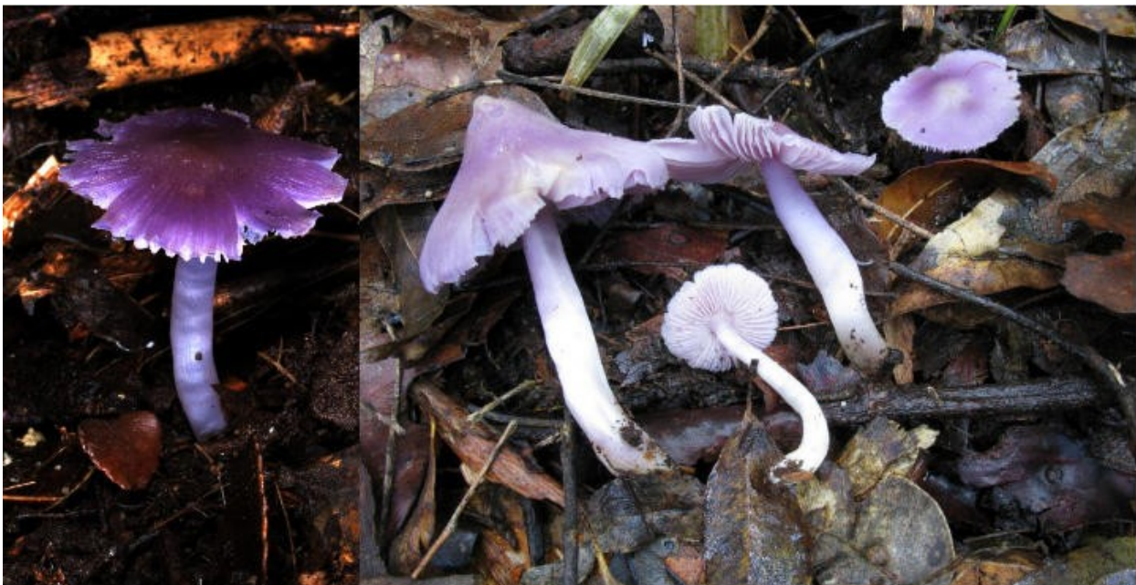
Figure 1. Hygrocybe lewellinae (© I Bell & SJM McMullan-Fisher).

Similar species are other white or pale waxcaps like Hygrocybe leucogloea .