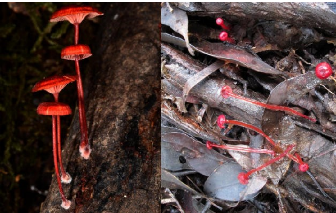
Figure 4. Mycena viscidocruenta