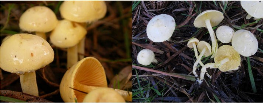
Figure 3. Hygrophorus involutus.