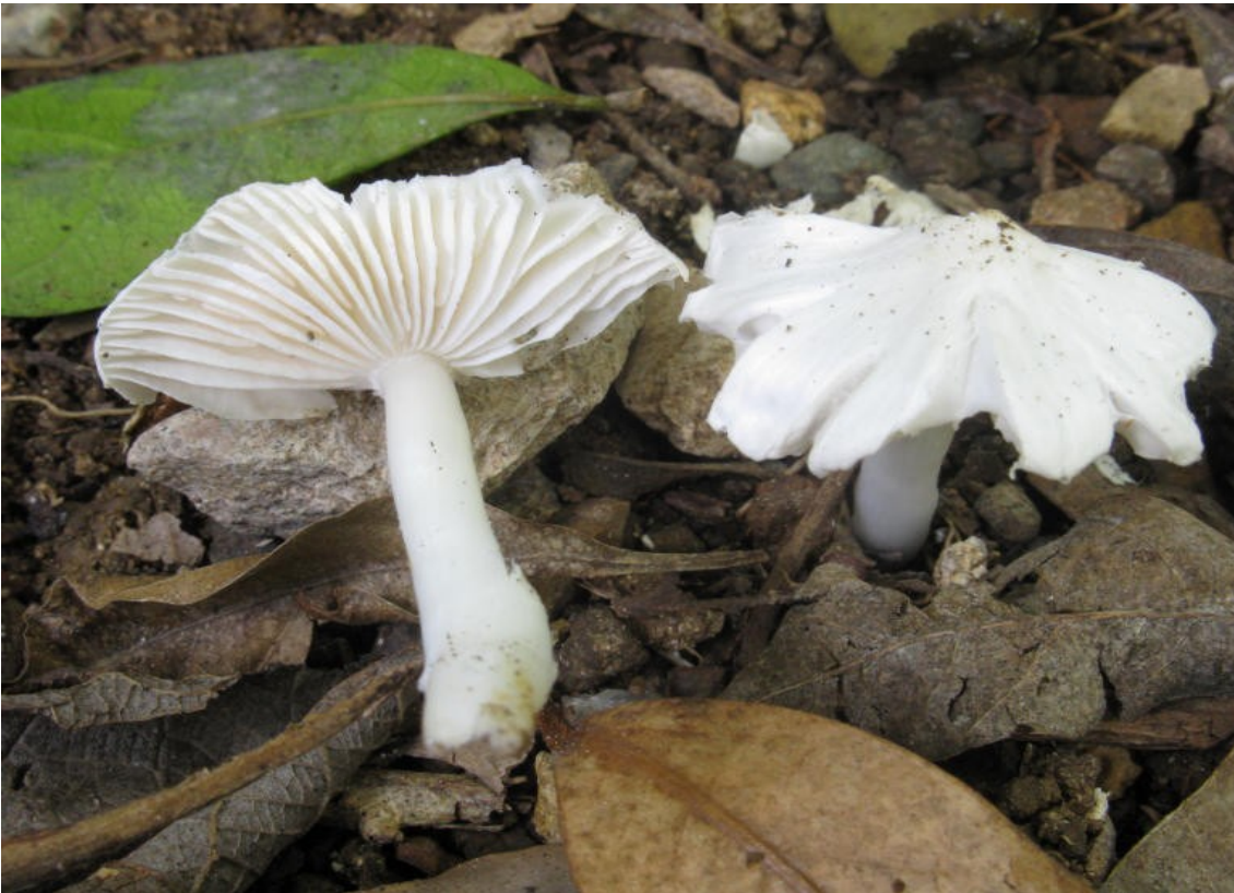
Figure 2. Hygrocybe mavis.