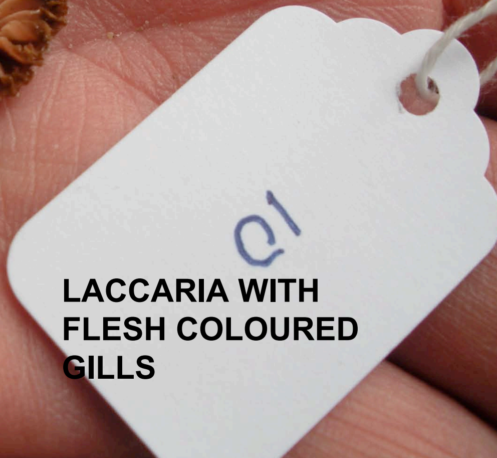
LACCARIA WITH FLESH COLOURED GILLS