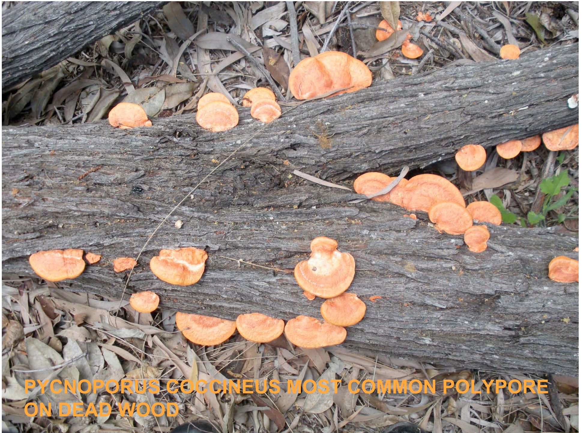
PYCNOPORUS COCCINEUS MOST COMMON POLYPORE ON DEAD WOOD