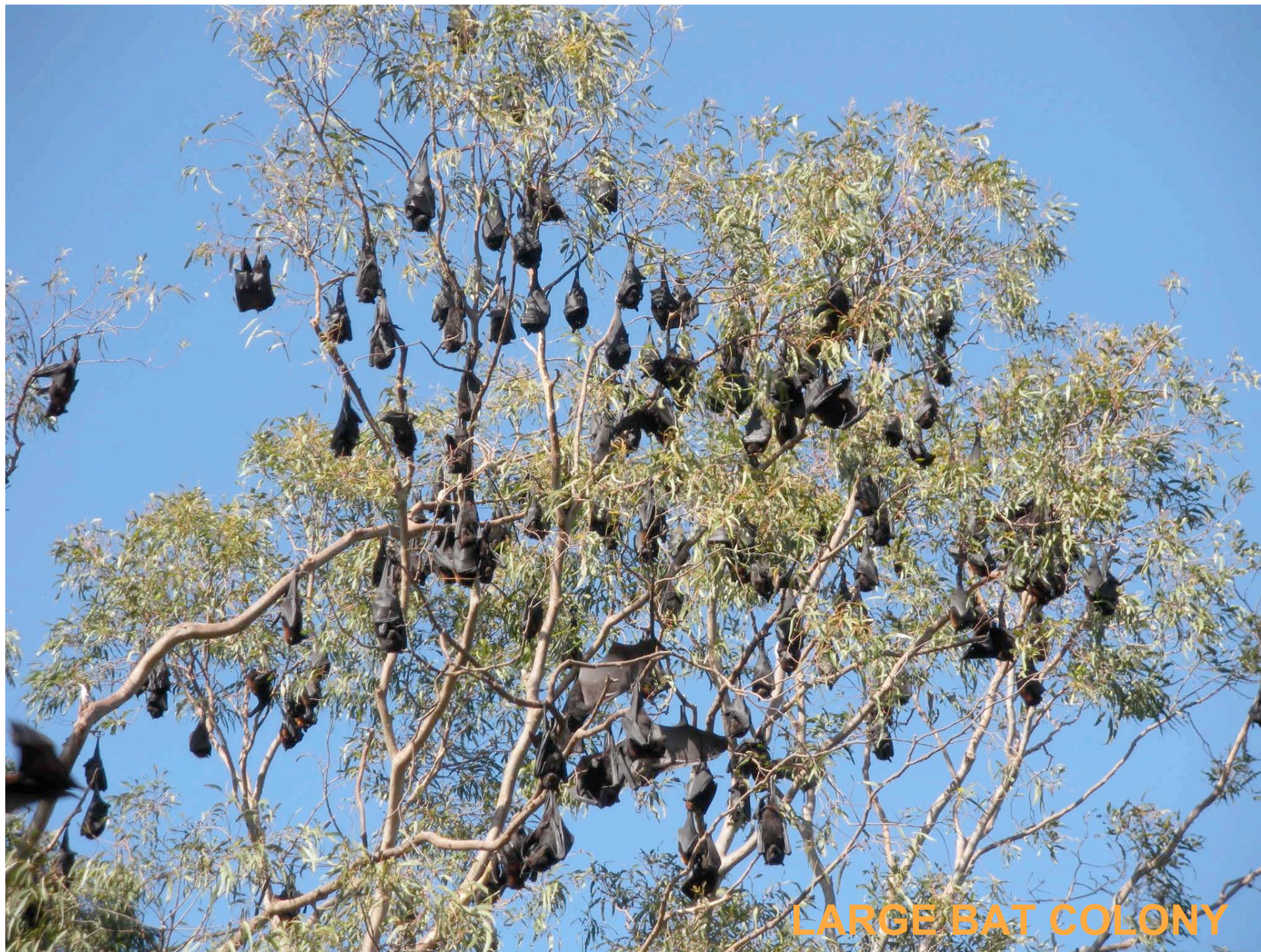
LARGE BAT COLONY