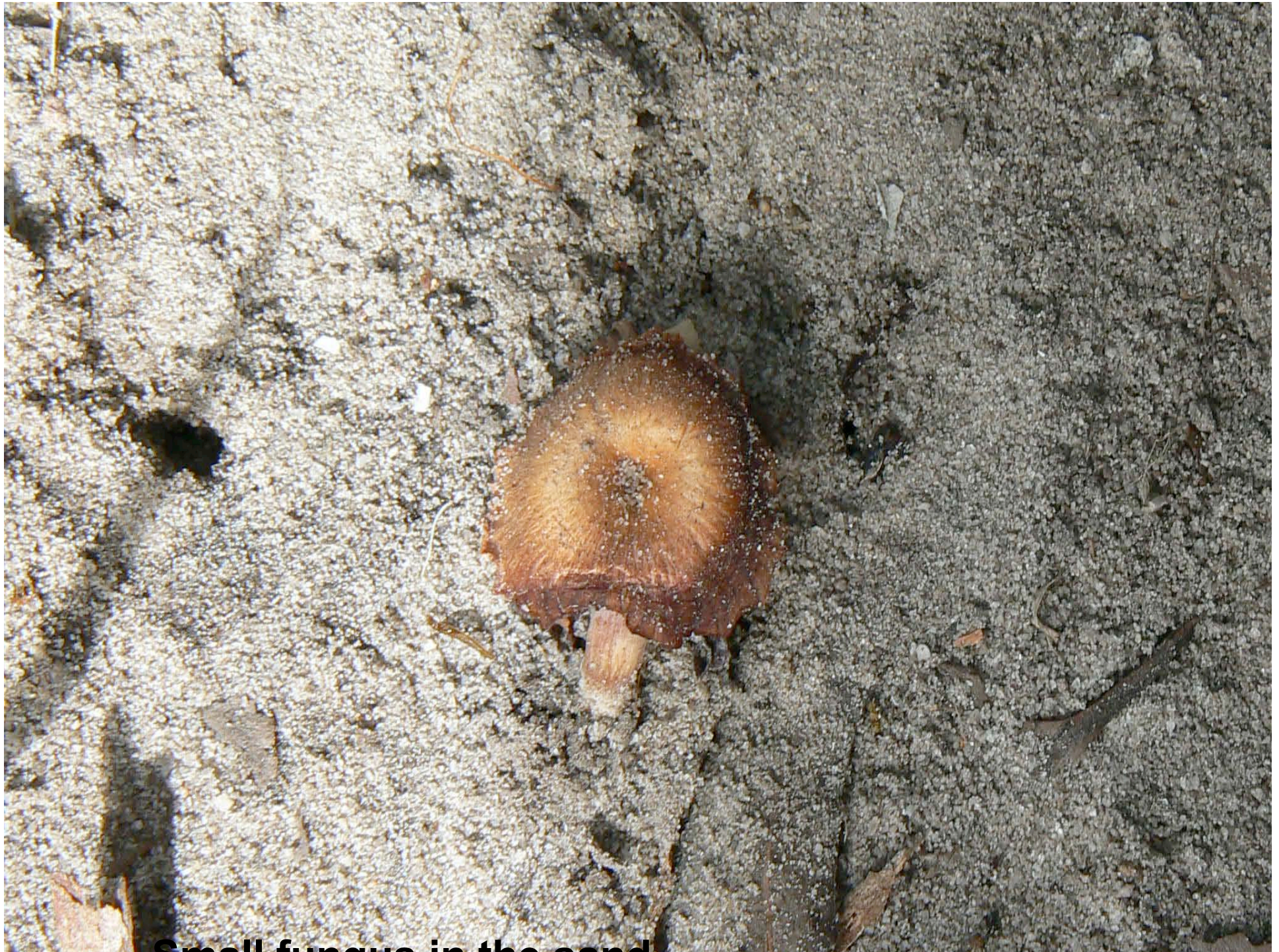
Small fungus in the sand