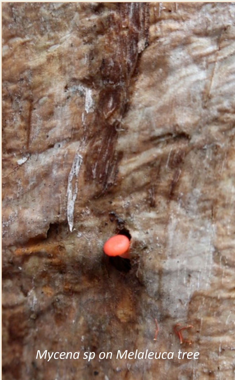
Mycena sp on Melaleuca tree