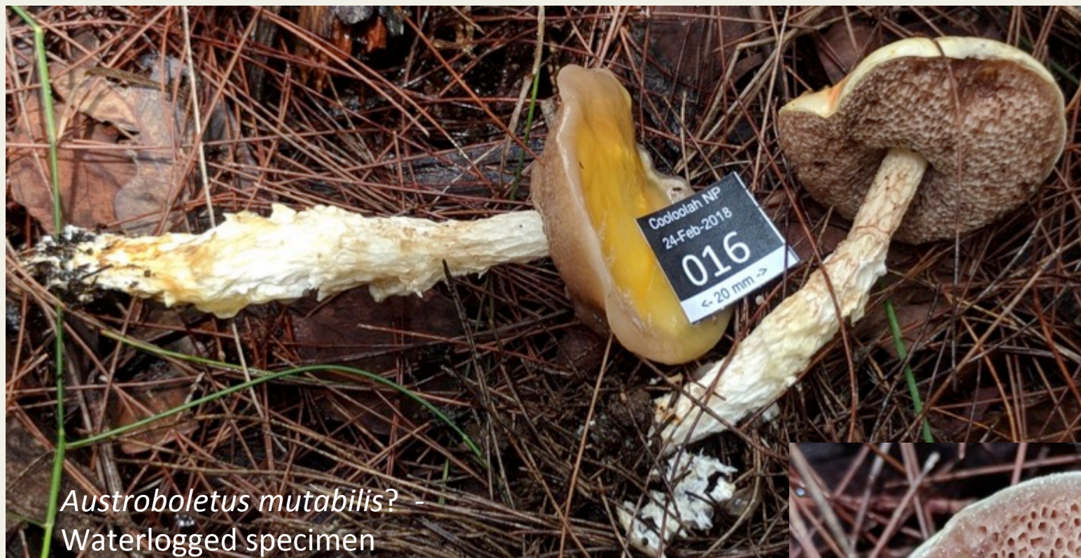
Austroboletus mutabilis ? - Waterlogged specimen