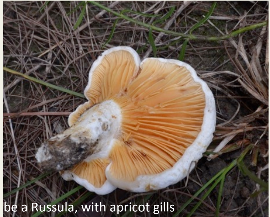
Further 2016 Cooloola specimen – thought to be a Russula , with apricot gills

These specimens from Davies Creek FNQ 2018, are Multifurca sp. ('forked gills')