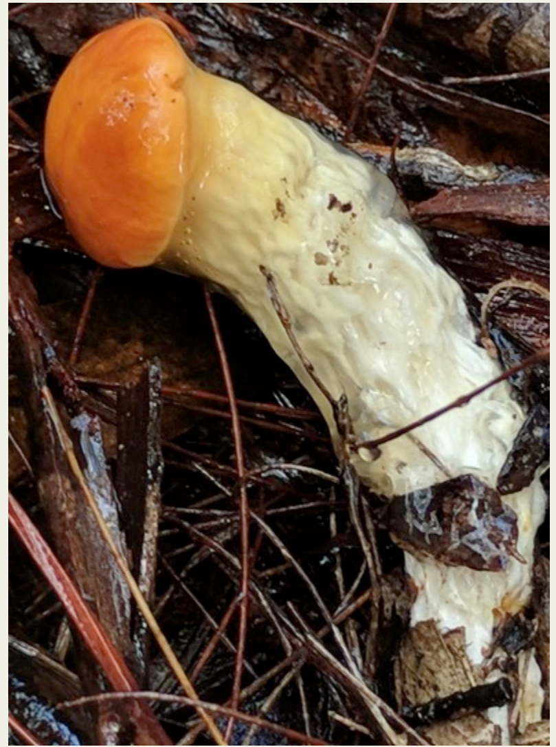
Austroboletus mutabilis juvenile?