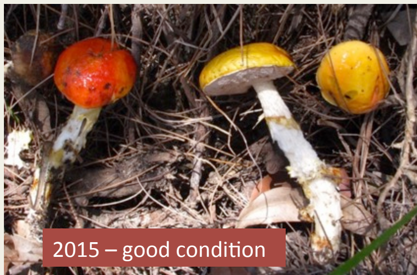
2015 – good condition