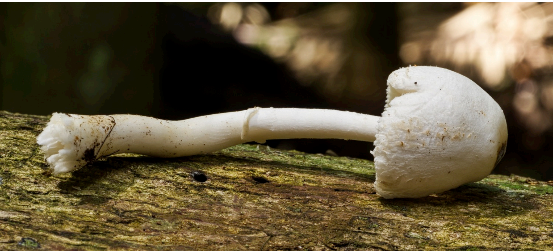
Leucoagaricus ooliekirrus ?