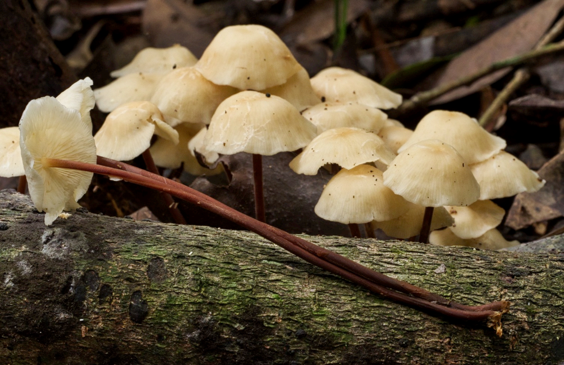
Marasmius sp 4