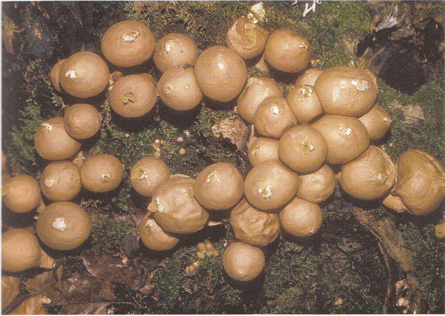
Fig. 109. Lycopodon pyriforme . (Bedfordshire, Maulden Woods, Nov. 1976, Outen).